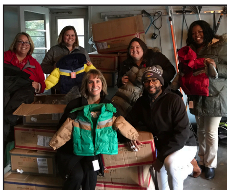
Urbandale School Facilitators of Family Outreach