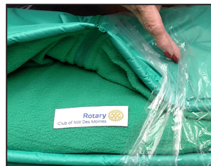
Labeled and Ready To Go!