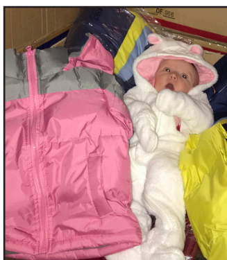
New Baby Romper