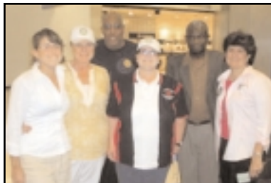
Houston Rotary Team The Rotarian team arrives home in Houston, Texas, USA, four days after Haiti earthquake.