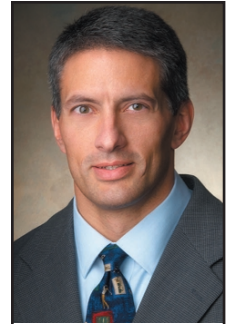
"Demography is destiny." - Auguste Compte

On some level, our club is a microcosm of this dynamic - the changing of the times. To survive and to thrive, we need to find a way to energize our current members and make their Rotary experience meaningful to them, while striving to accomplish the same feat for those future members who will make up the club in the coming decades. Perhaps, for both our club, and our World, the first step is to start learning to think not in terms of "us or them", but rather, in terms of "us and them".