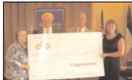
Urbandale Food Pantry