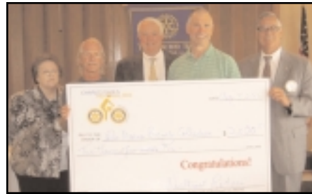
Des Moines Bicycle Collective