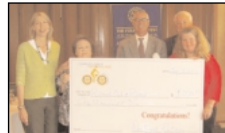
Reach Out & Read