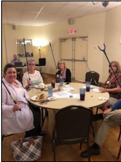
Member interest in the highway project is picking up.