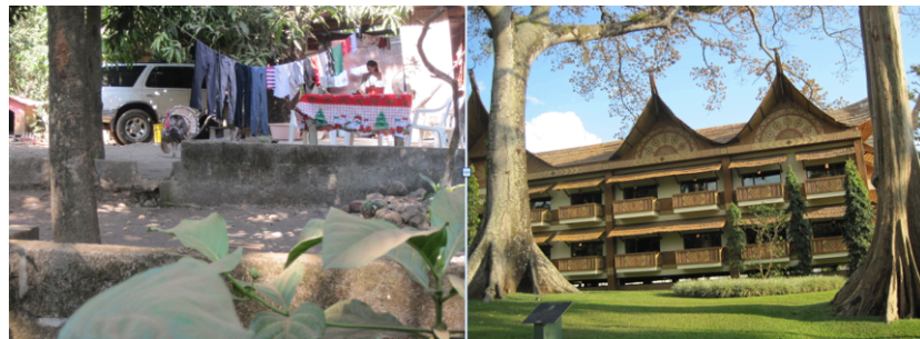
Aurla's Home where we attended a microcredit group meeting (note the turkey in the foreground) - Quite the contrast to the place where Rotarians stayed for the night.

Their child's education is the central theme of their parental work and commitment.