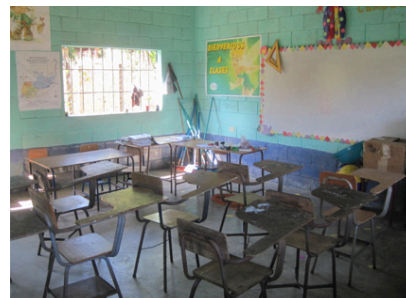
Typical village - Guatemalan Village Classroom