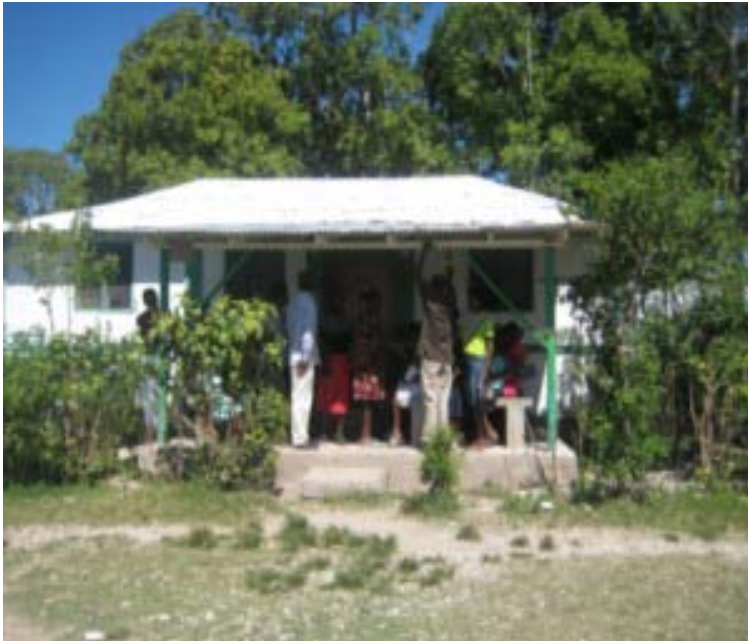
< Old clinic