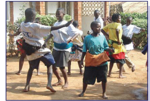
The Bitone Center for Disadvantaged Children in Uganda World Community Service Project

In 2004 we launched the "Backpacks for Kids" project. On an annual basis, in partnership with Traverse City Area Public Schools (TCAPS), we distribute 1,000—1,500 fully supplied backpacks to deserving students. We also provide a number of backpacks annually to our local Goodwill and, in past years, have reached out to victims of Hurricane Katrina, to the Bitone Center in Uganda and the Lama Boys Primary School in Kenya. As of 2008 over 6,400 children have participated in the program.