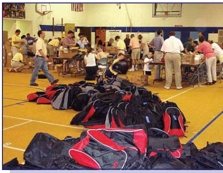
Backpacks for Kids assembly line process

As members of Rotary International we pay quarterly dues, participate in club activities and serve our community.