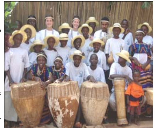
Bitone Children after a performance for Albion College students

to develop the skills to survive and thrive on their own, exposes them to a variety of different people and settings, builds communication and interper-