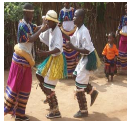
The Bitone Troupe performs Runyege-Ntogoro, a courting dance from Southwestern Uganda.