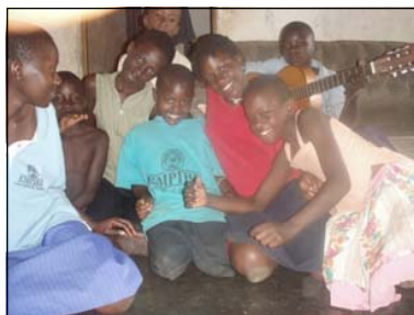
It's always time for music at the Bitone Center!

Our Philosophy remains that every child, regardless of their cultural background, color, gender or race has the potential and deserves the chance to excel and shine.