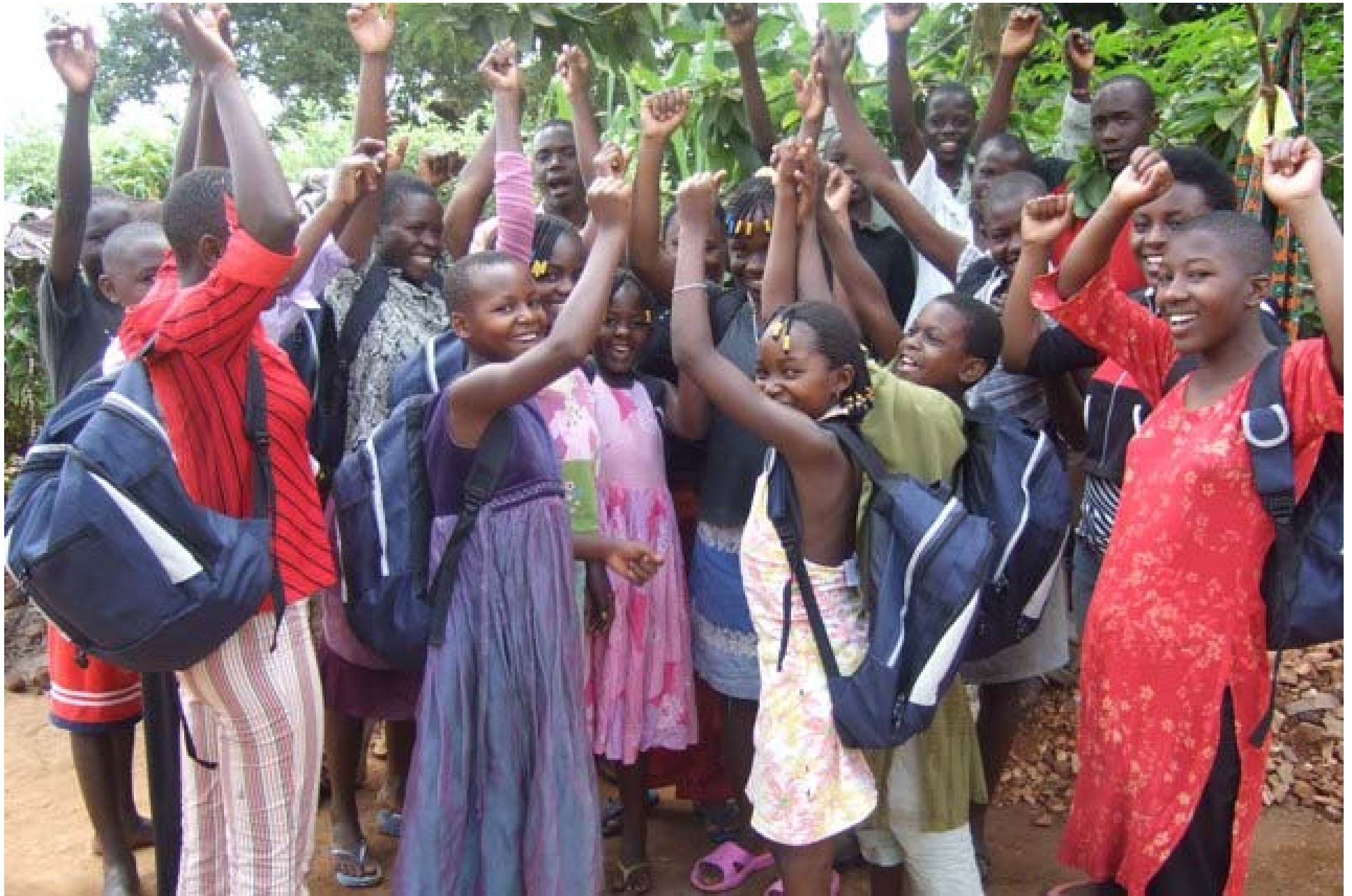
Bitone kids proudly wear their new school backpacks from Sunrise Rotary !!!!