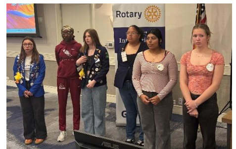
Students chatting with members