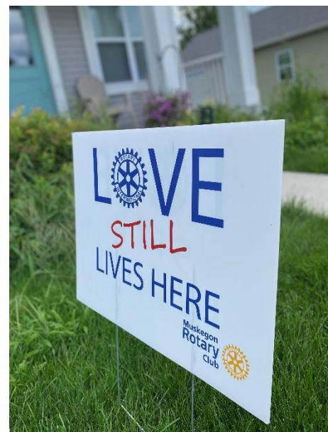
The signs are already appearing in yards like this one in downtown Muskegon, showing Rotary's support for love, peace and understanding in these challenging times.