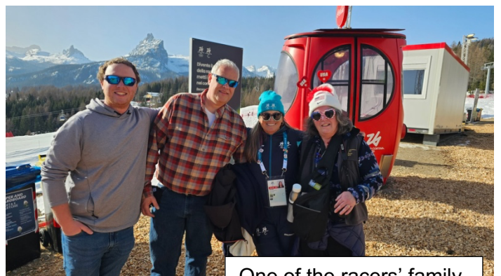
One of the racers' family