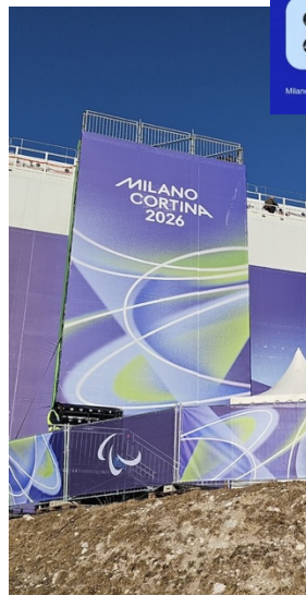
The Grande Stand for the Alpine finish area