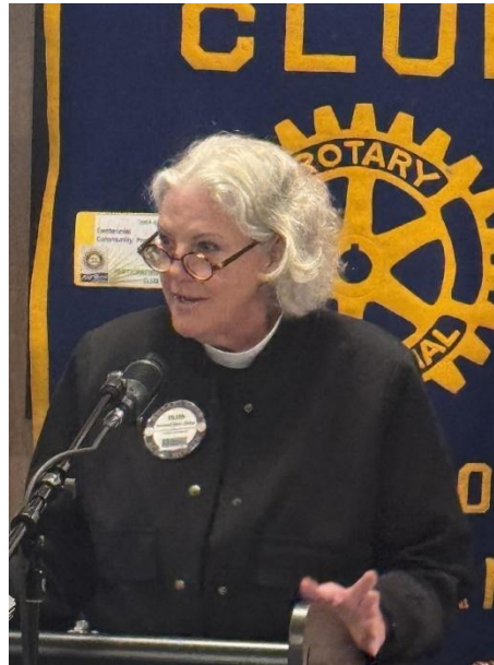
Reflection by Eileen Stoffan