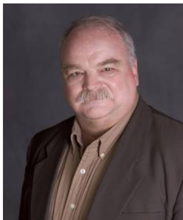
Hey, I know that guy.