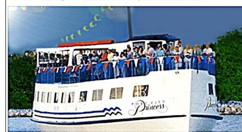
PORT CITY PRINCESS CRUISES

Cruise on Muskegon Lake & Lake MI Daily & themed cruises.