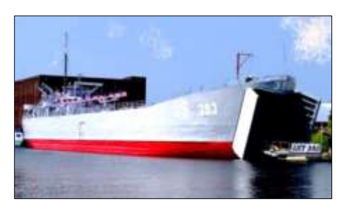
Here's Muskegon's newly-painted LST393