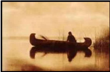
Kutenai Duck Hunter

RELATEDLY, THE MUSKEGON MUSEUM OF ART, IN MAY 2017, WILL PRESENT A ONCE-IN-A-LIFETIME EXHIBITION OF NATIONAL SIGNIFICANCE: EDWARD S. CURTIS: THE NORTH AMERICAN INDIAN .