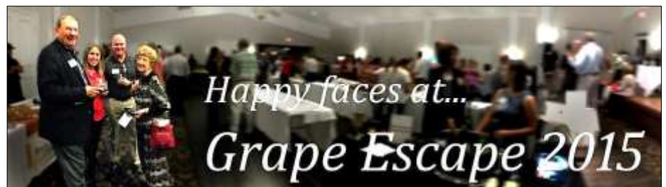
Happy faces at... Grape Escape 2015

← You're looking at some of the staff, two members of the board of directors, and a sampling of the 300 great kids currently being serviced by the Boys & Girls Club of the Muskegon Lakeshore, after only a few months in operation. Great things are happening there which you'll read about inside.