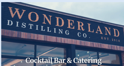
Cocktail Bar & Catering