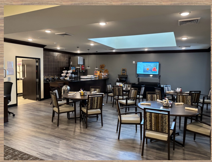
Muskegon Rotary in Motion Newsletter – Page 10