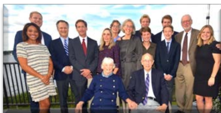
The Inaugural Roger A. Andersen Lifetime Community Leadership Award