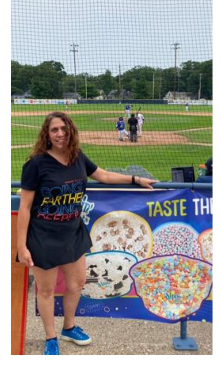
Muskegon Rotary in Motion Newsletter – Page 6