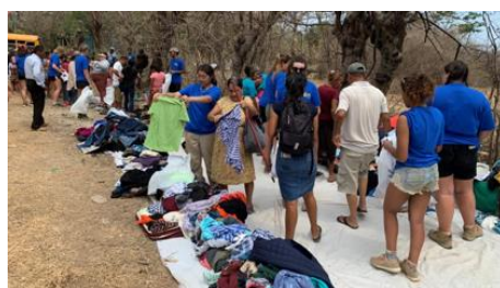
Donations included a variety of items such as clothes, shoes, books, personal hygiene, etc.