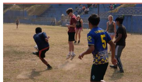
A Soccer game that they did not win – But still had fun