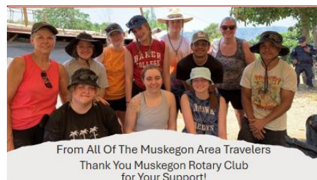
From All Of The Muskegon Area Travelers Thank You Muskegon Rotary Club for Your Support!

The students shared a lot of information and pictures with us on the service trips to Honduras and El Salvador. You don't want to miss this!