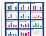
MHDC's efforts as a result of the CHNA Health Disparity Report Card

The health disparity report card has evolved over time and is located on their website, as well downloadable as a PDF. They were able to tabulate infant health and mortality rates, mental health, diabetes, sexually transmitted infections, substance use, poverty and other health conditions associated as disparate for persons of color.