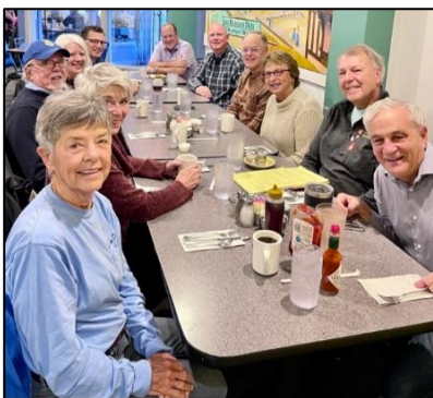
Monthly Muskegon Rotary Leadership meeting at Carmen's