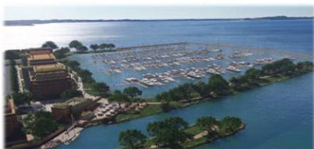
Proposed image of the final project

Other exciting amenities include short-term transient shopper docks to create a waterfront destination for local area boaters. ADA compliant kayak and paddlecraft launch, and affordable rental opportunities to make boating accessible to everyone regardless of age, income, or ability. None of the current bike path will go away; they are including expansion of the path in their plan.