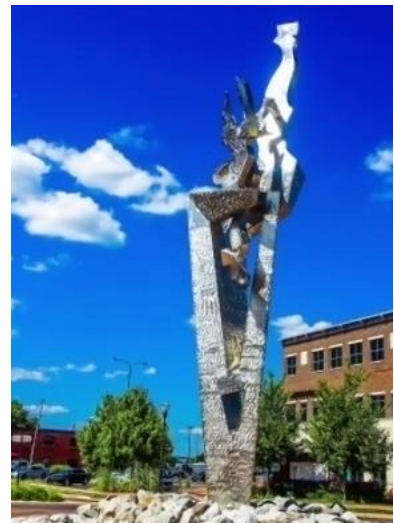
Muskegon Rising Together by Richard Hunt.

The first big project the Public Art Initiative worked on was with a Chicago sculptor, Richard Hunt. His sculpture in the downtown roundabout is one of his very best works.