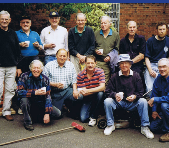
The clean up team preparing for the grand opening