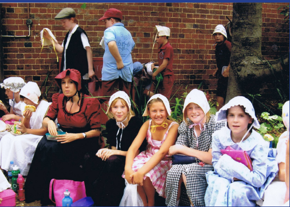
International Bonnet competition Ceremony at the Old Geelong Gaol