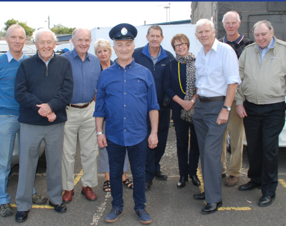
The Rotarians assisting Tony Robinson at the Gaol.