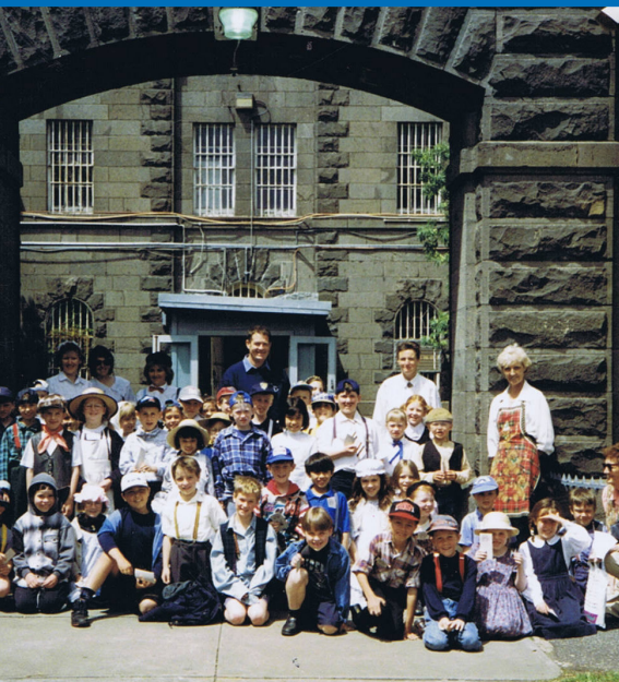
One of the hundreds of school groups that have visited the Gaol over the 24 years.