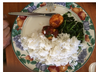
Rice, Spinach and Deep fried boiled egg