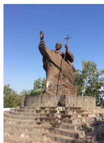
Statue of Pope John Paul