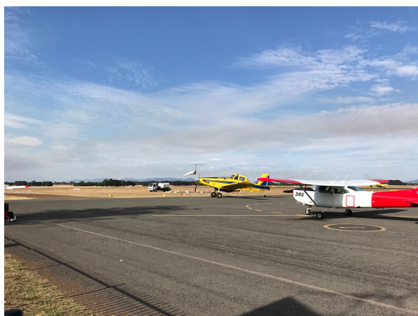
One of the planes coming in to fill up with water.