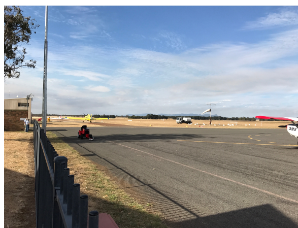
Filling the plane.