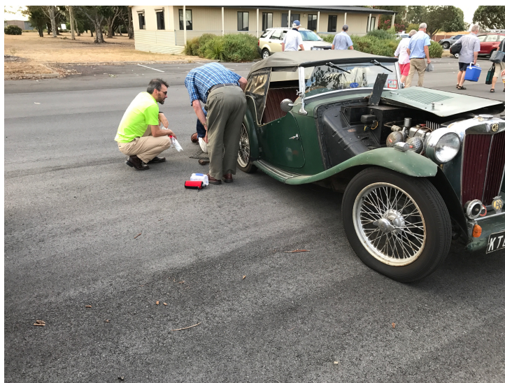
Fixing a flat tyre on the beautiful MGTC