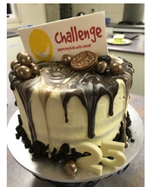
CHALLENGE BIRTHDAY CAKE