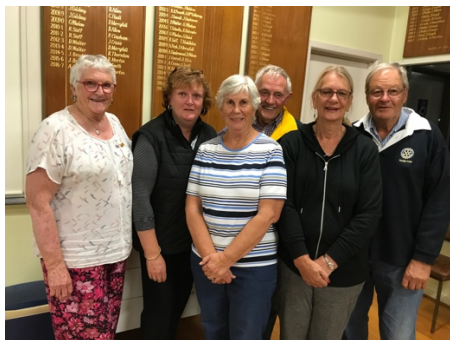
HELPERS AT THE CHALLENGE DINNER