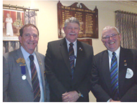
DG's official visit