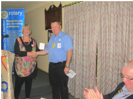
Mental Health Hat Day