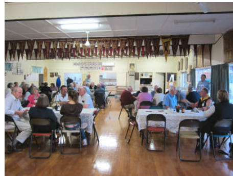
Bowls Match with Hamilton North