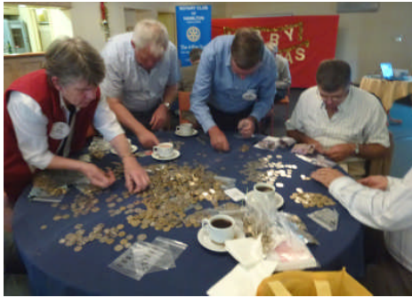
Counting the Coins