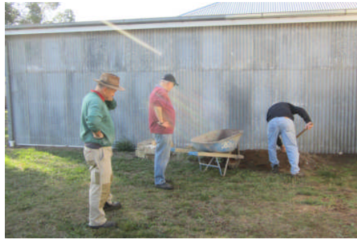
Working at Pastoral Museum