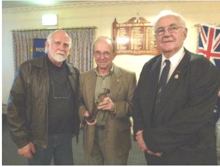
Ted Kenna Memorial statue project