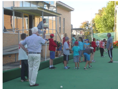
Challenge Cancer Kids weekend