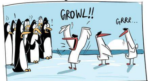
Arctic Terns telling stories from the South