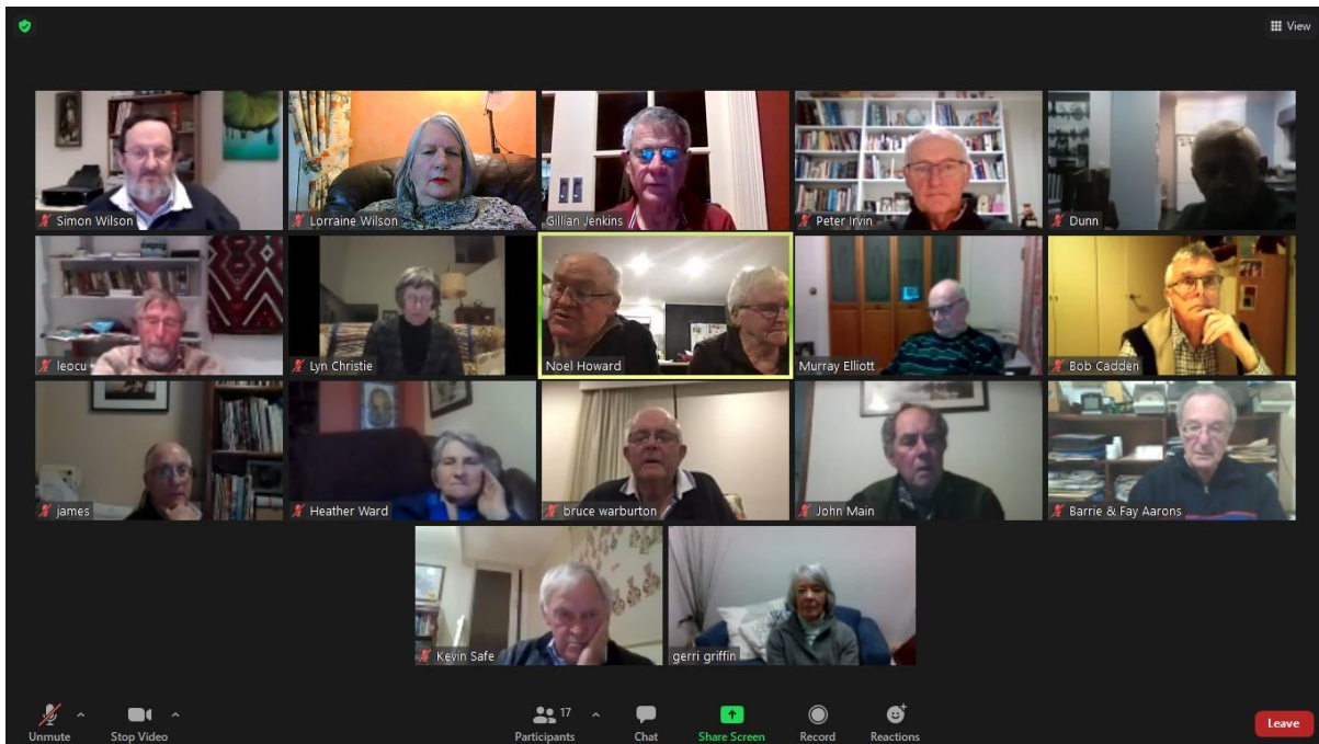
All looking very attentive.