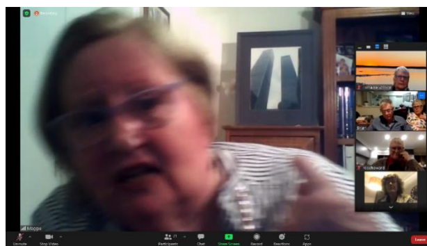
Photo in the background of the Twin Towers taken the day before 9/11