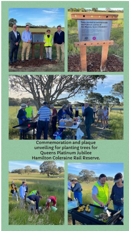
Commemoration and plaque unveiling for planting trees for Queens Platinum Jubilee Hamilton Coleraine Rail Reserve.