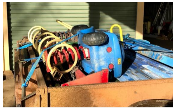
Packed to go.

Donations in Kind use funds donated to assist with the shipping costs of supplies in containers to overseas countries.