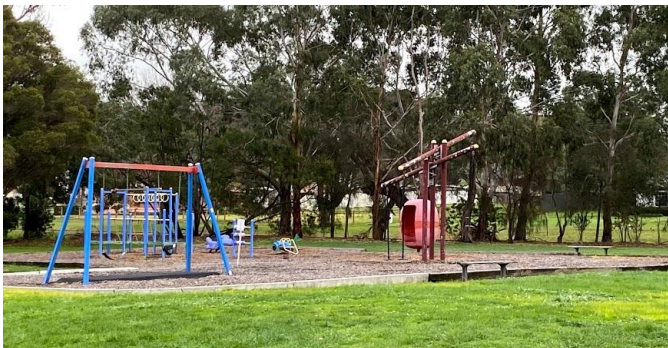
The old playground