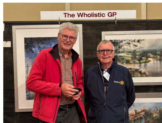
Visiting Rotarian from the Netherlands at our Art Show