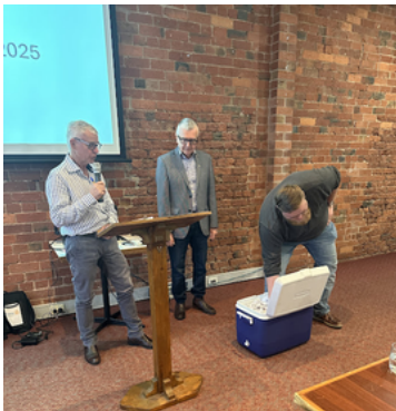
Digging deep to draw the Art Show Raffle