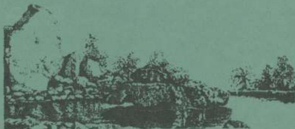
Veta Landt Memorial Fountain