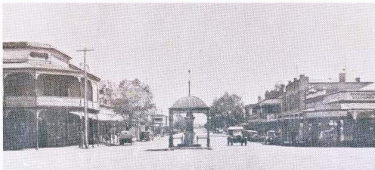
Wilson Street, Horsham, 1920, looking west from Firebrace Street. Restoration of the fountain in the foreground, now in May Park, is a Horsham East Rotary Club project.

The Rotary International theme for 1987-88