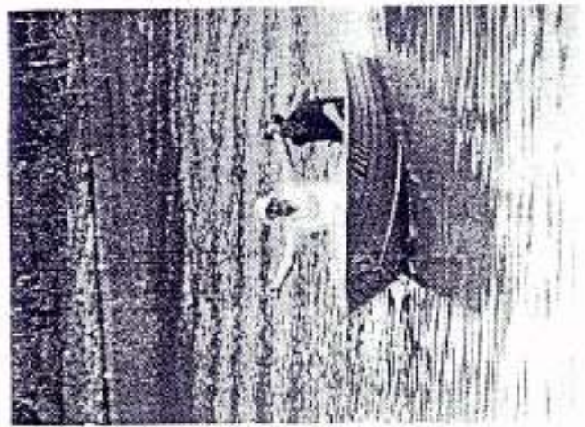
Exaggeration, wishful thinking or just lying?