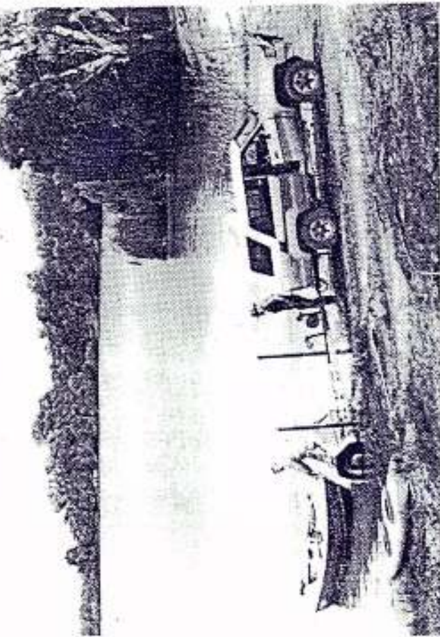
Getting ready to bring home the fish; forget the dirty clothes!