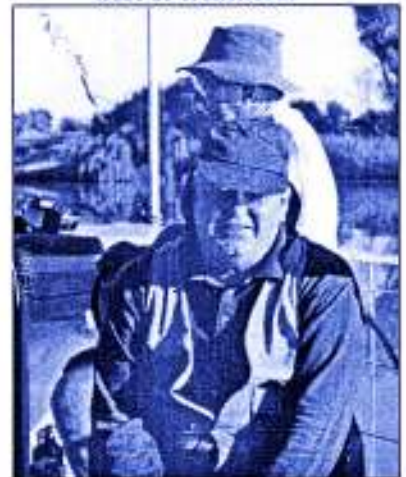
Waiting for a catch