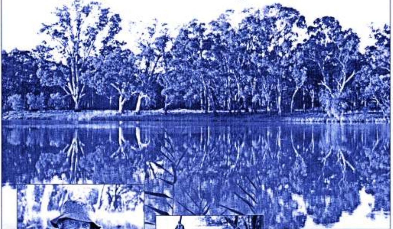
The Murray River at Fort Courage, west of Wentworth