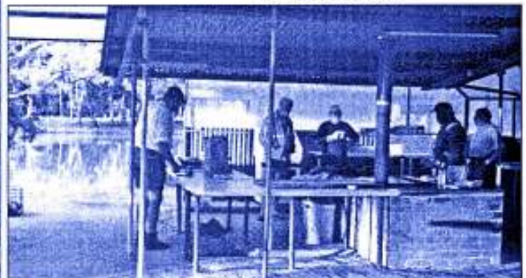
Breakfast time Murray River in background