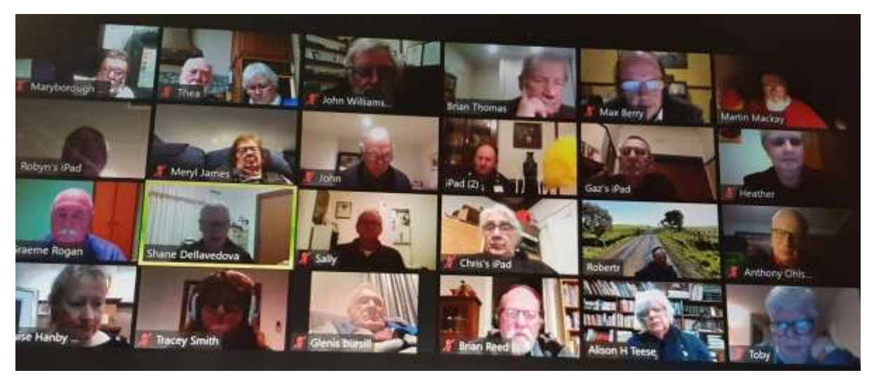
One of the early Zoom meetings

I imagine that every other Rotarian report prepared for this Annual Report will have mentioned Covid-19 and what effect it has had on us all. Never did I imagine that agreeing to be Membership Chair for 2020-21 would have provided as many challenges as it did. Prior to me taking over we had already been in a long period of lock down due to the outbreak in Victoria. We would have had no idea then that it still would have been affecting us 12 months later when I had agreed to continue in this role.