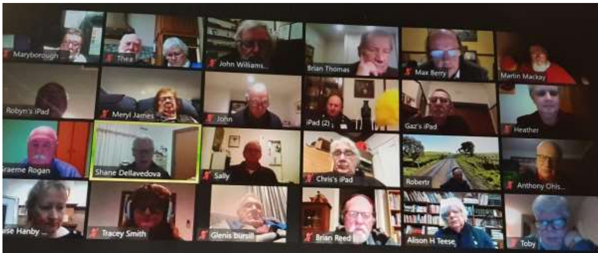
One of the early Zoom meetings

I imagine that every other Rotarian report prepared for this Annual Report will have mentioned Covid-19 and what effect it has had on us all. Never did I imagine that agreeing to be Membership Chair for 2020-21 would have provided as many challenges as it did. Prior to me taking over we had already been in a long period of lock down due to the outbreak in Victoria. We would have had no idea then that it still would have been affecting us 12 months later when I had agreed to continue in this role.