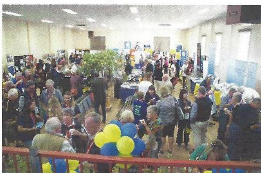
House of Friendship