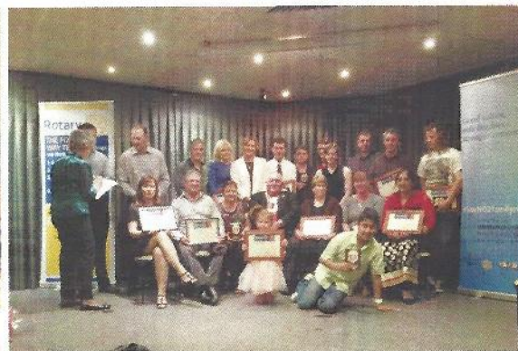
Pride of Workmanship Awards