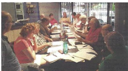
Conference Committee meeting