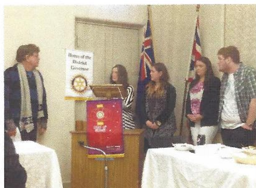
Students visit the Club

It has been wonderful to see what can be achieved by a motivated group of Rotarians within the communities we live in as well as beyond by working together for the benefit of the world.