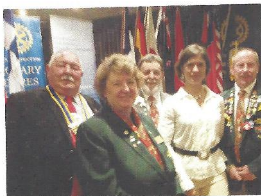
District 9780 Youth Exchange Weekend