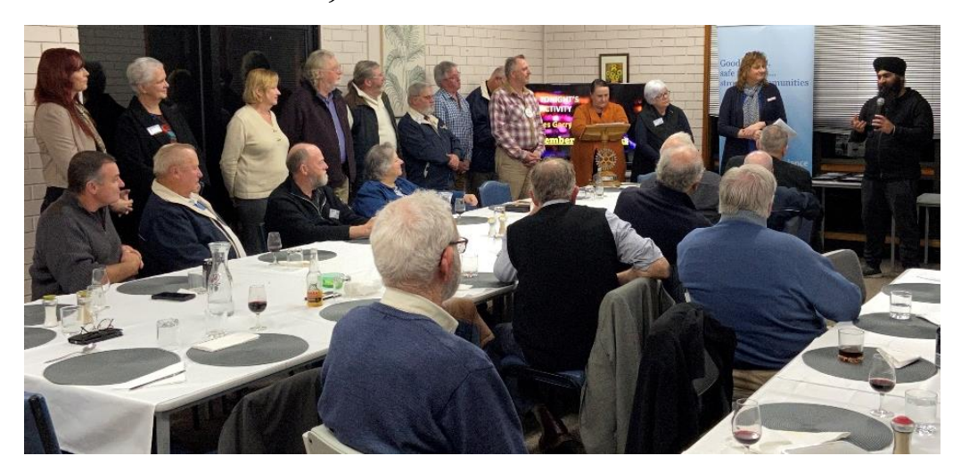
Our Induction Dinner meeting – Thursday 16th June 2022.