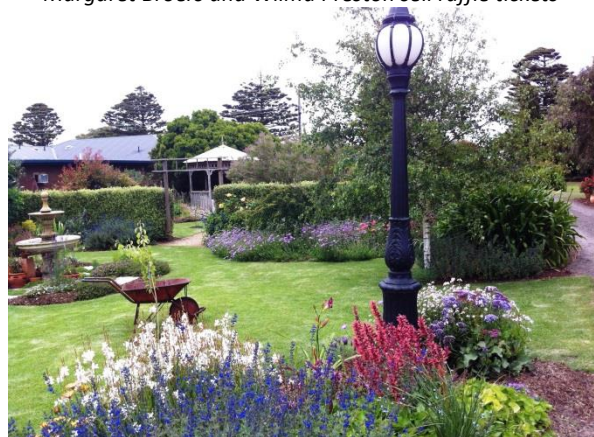
Dot & Ron Cashmore's garden – Open Gardens Day