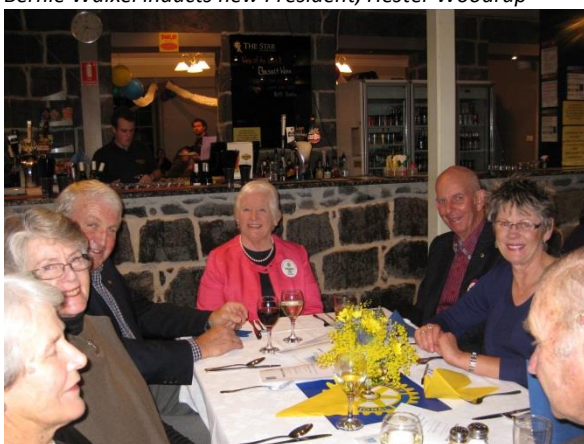
Rotarians and guests enjoy the evening