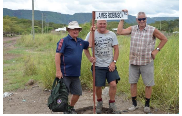
The road in Tanzania named after Jim Robinson